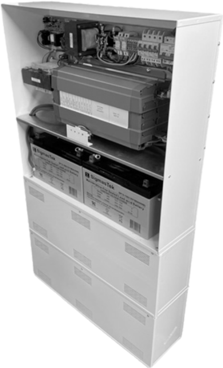
OPEN PANEL VIEW