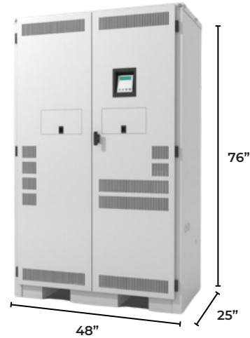
Models 6.0kVA to 16.7kVA