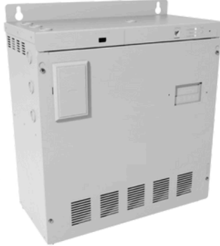
350 or 550VA/W