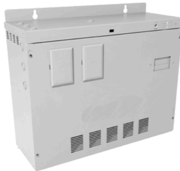
750VA / W